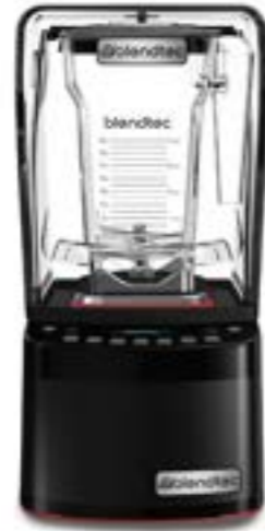
V213 - Stealth 885 Blender No jars