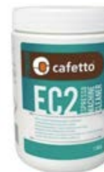
E208 Espresso Machine Cleaner EC2 1.1Kg