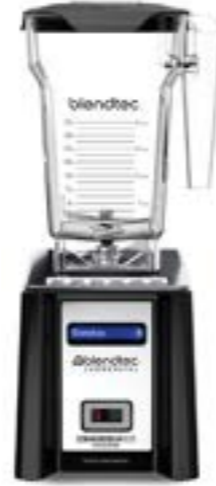
V203 - SpaceSaver 825 No jars