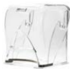
V121 - Connoisseur Sound Enclosure