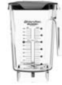
V112A - WildSide 1.5L Lid not included