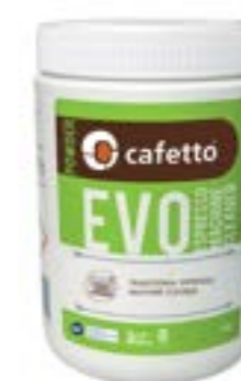
E201 EVO Espresso Machine Cleaner 1.1Kg