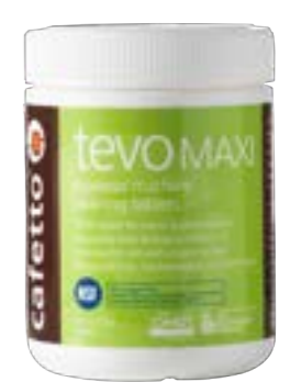
E203 TEVO Maxi Tablets 150 tablets