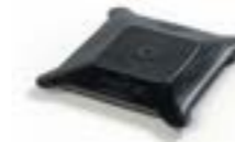
V112D - Flat Hard