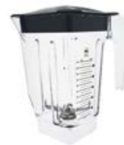
V112H - Wildside Ultra Jar & Lid with spout 1.5L Lid included