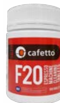
E209 Espresso Machine Cleaning F20 100 tablets