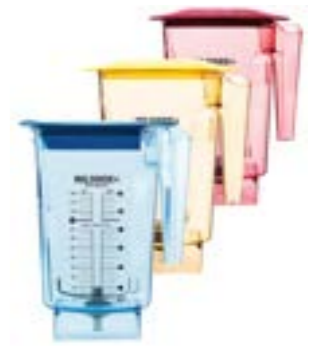
WildSide 1.5L Jars & Hard Lid Set V112F - WildSide Pink V112E - WildSide Yellow V112G - WildSide Blue