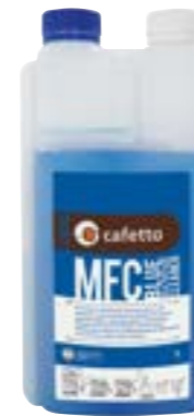
E202 MFC Blue milk frother cleaning liquid concentrate 1L