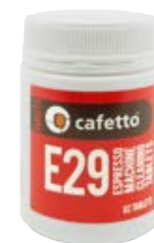
E211 Espresso Machine Cleaner E29 62 tablets