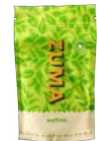
Packaging - Case 10 x 100g pouches