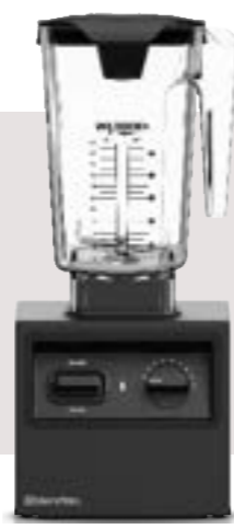
V205 - Bar Blender with x1 90oz Wildside Jar & Cone Lid