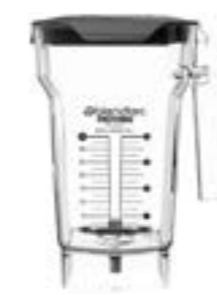
V111M - Cold Foam Frothing 1L Lid not included