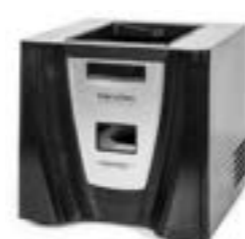
V122A - Connoisseur Motor Enclosure