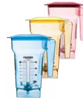
FourSide 1L Jars & Hard Lid Set V111J - FourSide Pink V111H - FourSide Yellow V111Q - FourSide Blue