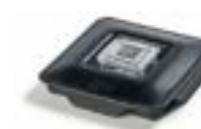
V112B - Vented Gripper