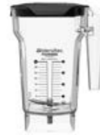
V111A - FourSide 1L Lid not included