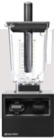
V206 - Chef with x1 Wildside Ultra XL Jar & Tamper