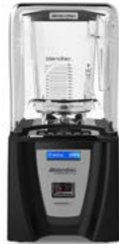
V208 - Connoisseur 825 No jars