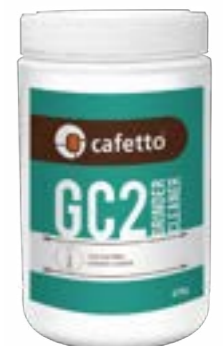
E204 Grinder Cleaner GC2 450g