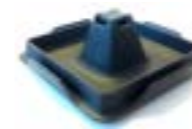
V112C - Cone