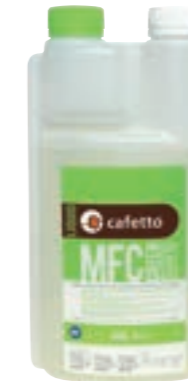
E207 MFC Green milk frother cleaning liquid concentrate 1L