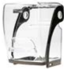
V121A - Stealth Sound Enclosure