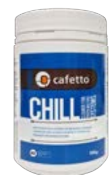
E210 Chill Cold Beverage Cleaner 500g