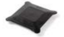
V112 - Flat Soft