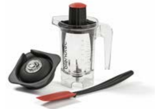
V111D Twister includes Jar, Twister lid, Vented gripper lid and spatula